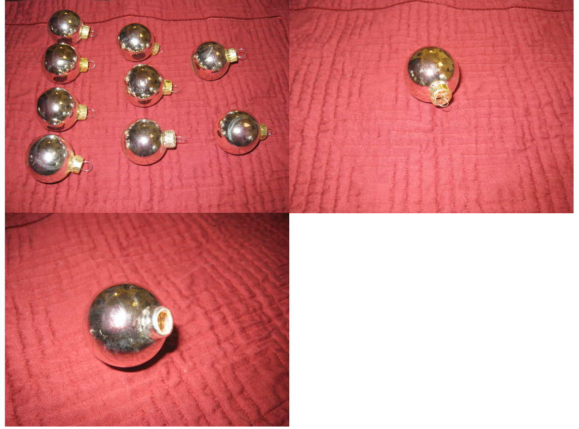
Step 33: Glue 27 Christmas ornaments around inside ring (leaving a gap between two ornaments which will become the 'gate spheres').

Step 32: Remove the hanging caps off of the Christmas ornaments.