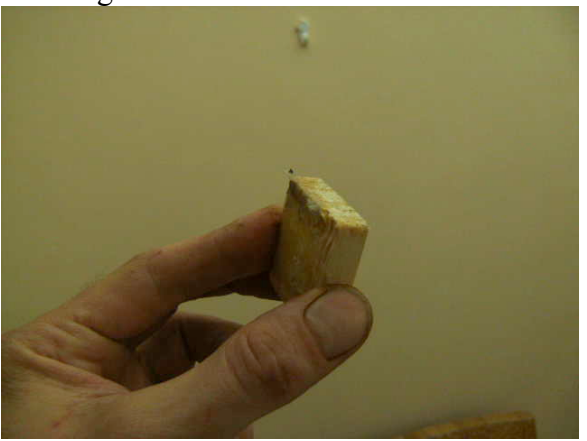
Step 13: Glue the 4 supports in a cross shape just inside the Upper Lid hole.

Step 12: Measure the height from the Base up to the Upper Lid and cut 4 wooden supports of that height.