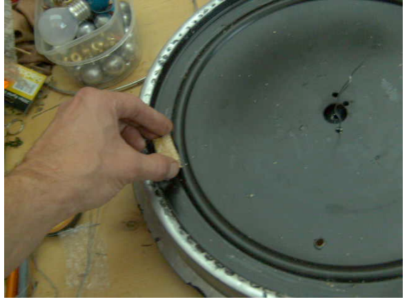
Step 10: Glue the supports in around the inside of the rim.

Step 9: Cut up some 1/2" chipboard/wood to make supports for the Upper Lid.