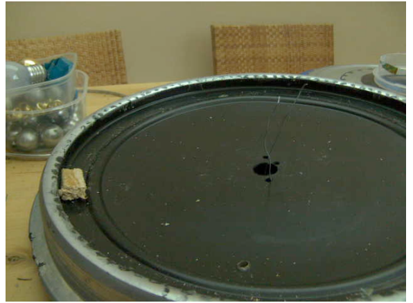
Step 8: Pass wire through Base Tin Lid holes through holes in Base.

Step 7: Drill 2 small holes, 1" apart, in the center of the second Harcostar Container Lid. This will become the Base.