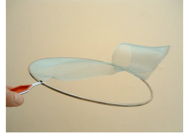
Step 30: Glue splatter rim onto hull

Step 29: Remove splatter screen from splatter screen rim. Remove handle from splatter screen.